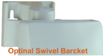
Optinal Swivel Barcket